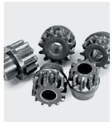
Examples of parts prestressed by STRECON Axi-Fit