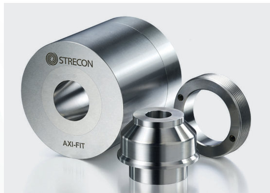
Principle of STRECON Axi-Fit Container: Main tool body, pressure pad, and ring screw