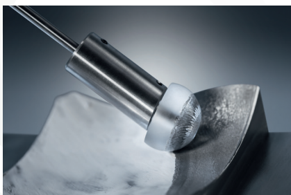
3D polishing of double-curved surface

The RAP machine can be applied for precision polishing of tools and molds for various metal forming operations, injection molding of plastics and compound materials, and similar industrial applications. The RAP machine is also used for tribological work at universities and development centers as well as polishing of machine components. In short, the RAP equipment can fulfill the needs for high-precision surface polishing of a broad range of industrial workpieces, and it offers a controlled, repetitive, traceable, and quality consistent surface polishing process, and by that minimizes the impact of human variations.