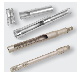
Hollow steering shafts