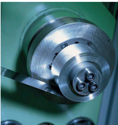
The stripwinding process

The STRECON container system has proved to be very cost-effective in mass production, and usually delivers 25-30% reduction of the tool costs.