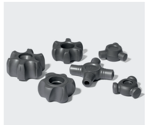
Examples of parts suitable for the STRECON E + system